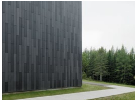
öko skin 147 mm, anthracite, vertical installation (1/3 shifted), screwed on aluminium substructure