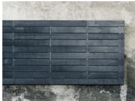
Coming soon! öko skin 147 mm, anthracite vintage, horizontal installation (1/2 shifted), glued on aluminum substructure