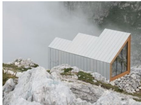
öko skin flex 147 mm, silvergrey, vertical installation, screwed on wooden substructure