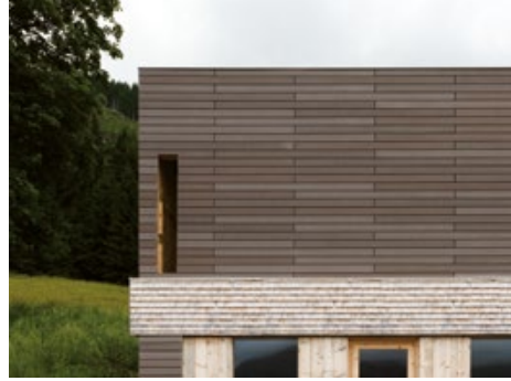
öko skin flex 125 mm, terra, horizontal installation (1/2 shifted), screwed on wooden substructure